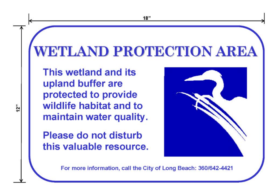
Strategy E1-3: Include at least one new interpretive panel on the city's boardwalk regarding shoreline functions and values and their importance.

Strategy E1-2: Offer the city's wetland signage to owners of property with wetlands at a reasonable cost, or if funding is found, at no cost. (see sign, below)